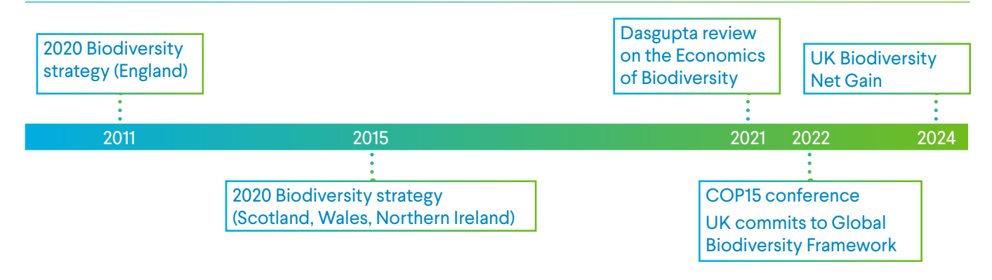
Figure 2: UK biodiversity timeline

There has been a growing trend towards stronger nature regulation, particularly in Europe, including the <u>EU Corporate</u> Sustainability Reporting Directive (CSRD) and the EU Deforestation Regulation, which both become mandatory requirements in 2024. The next section introduces Biodiversity Net Gain, which is coming into force in England in 2024/25.